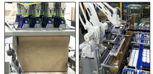
Case Packing Section

Note: Depending on application & design, the above utilities, speeds, case range can change.