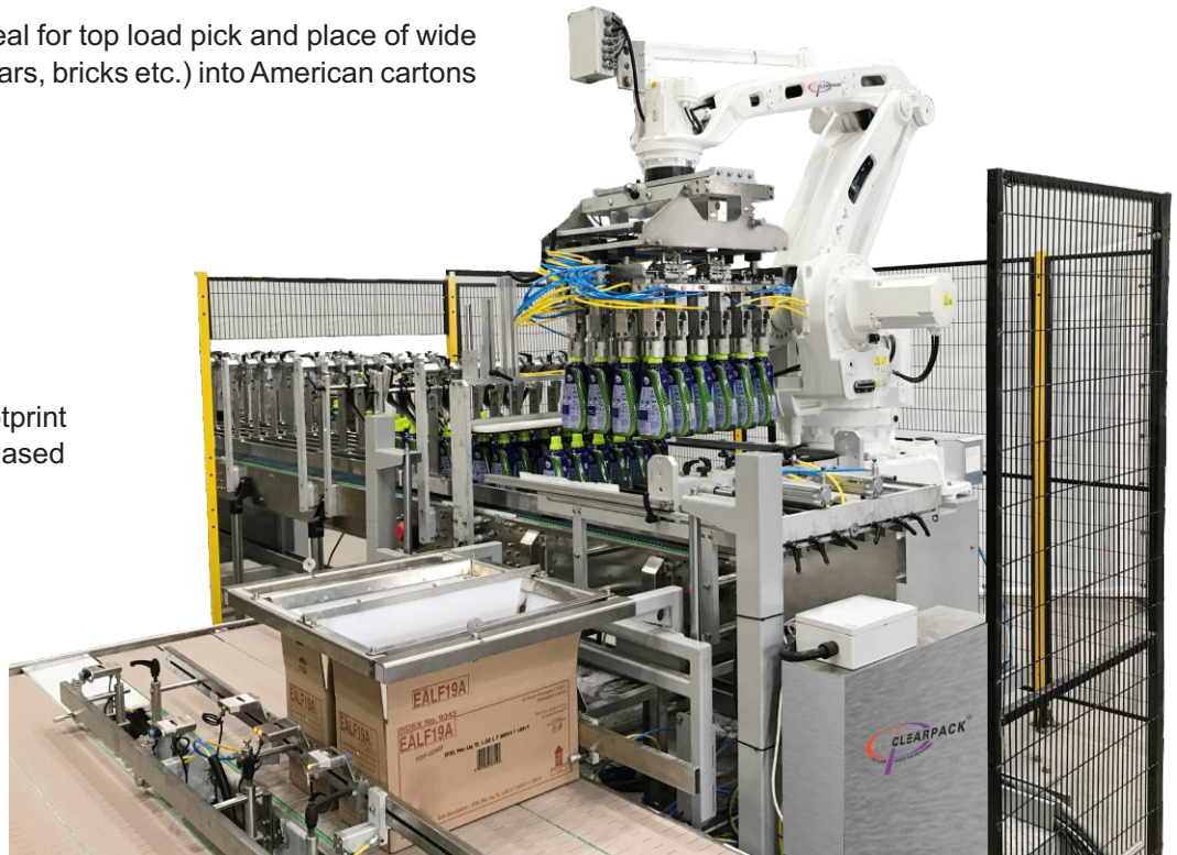
*Safety Fence in the front removed for sake of picture